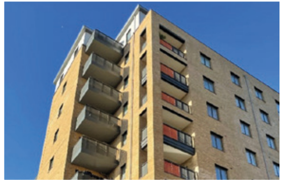
Balco's Levitate system