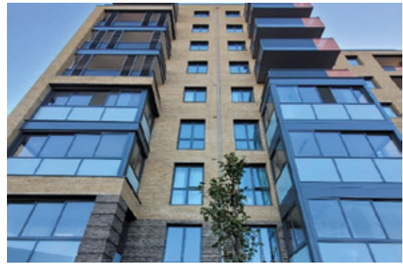
Balco's Winter Garden Glazing system